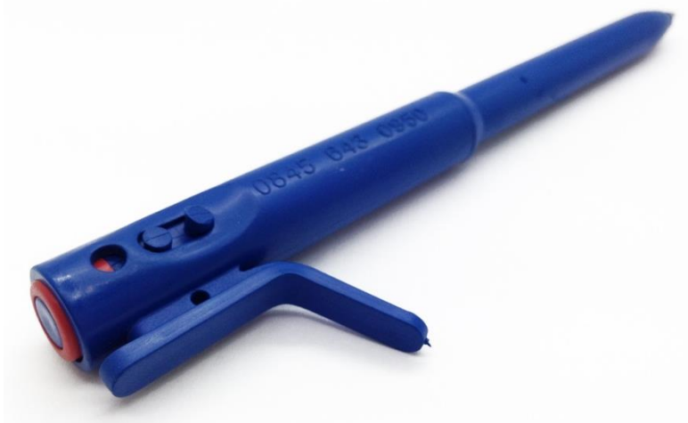
BST J800 Detectapen® - Snap me if you can

We actively encourage new and prospective users of BST XDETECT® products to test their mechanical performance by trying to snap or shatter them. Breaking a corner from a scraper, or the clip from a Detectapen®, is nearly impossible without tools. This shatter resistance even extends to harsh frozen food environments. This is a very simple way of showing that products manufactured from BST XDETECT® are stronger, more durable and ultimately safer products to be used in food processing environments