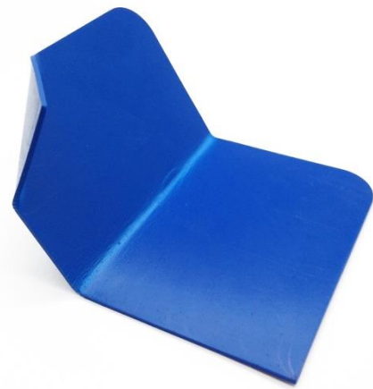
BST 1.5mm Palm Scraper