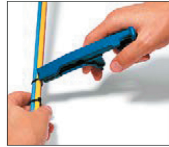
Step 3) Twist To Cut

The information provided in this product specification sheet is based on our experience and knowledge to date and we believe it to be true and reliable. This information is intended as a guide for your use of our products, the use of which is entirely at your own discretion and risk. We, BS Teasdale & Son Ltd, cannot guarantee favourable results and assume no liability in connection with the use of our products. © 2020 BS Teasdale & Son Ltd. All Content, Data & Images are owned by BS Teasdale & Son Ltd and are protected by international copyright law.