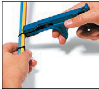
Step 2) Tension