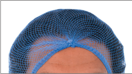
5mm Close Mesh Hairnet